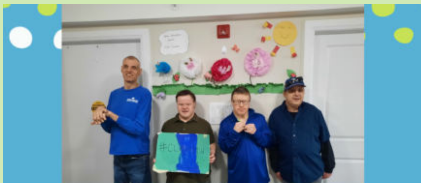
GREEN & BLUE DAY